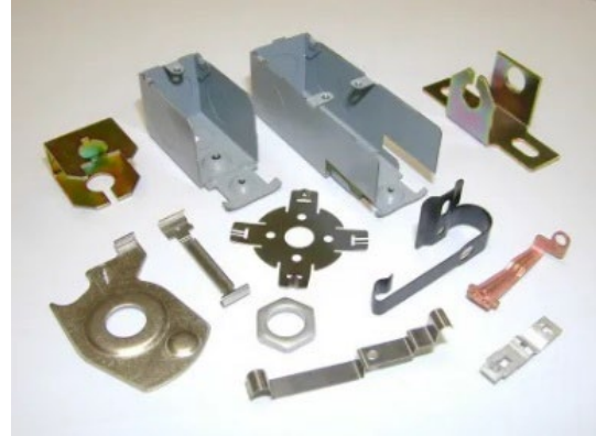
Progressive Die Stamping