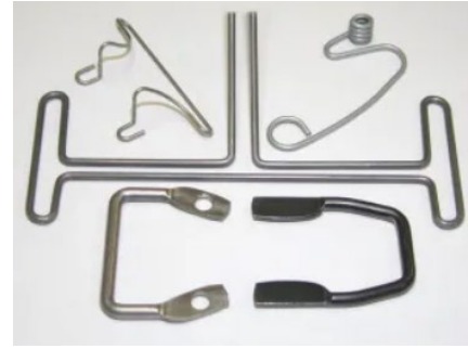
CNC Wire Forming