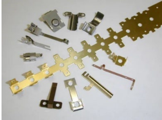
Fourslide & Multislide Stamping