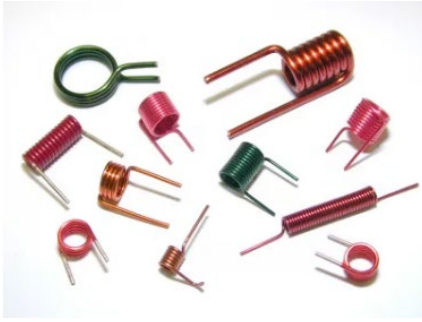
Air Wound Coils