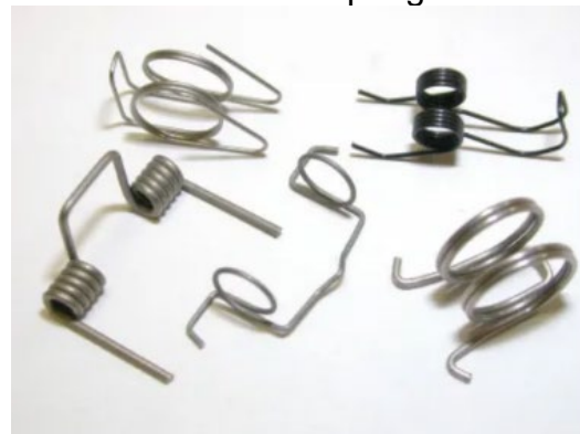
Double Torsion Springs