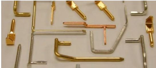
Connectors and Terminals