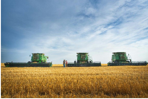
Agriculture / Construction