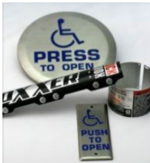
Custom Formed Nameplates