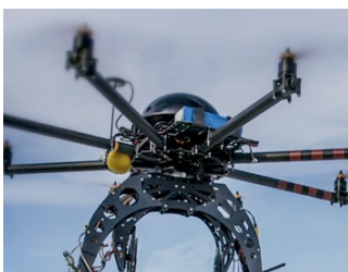
Robot & Drone

In step with manufacture industry trends, Nedec is making history in leadership to allied industries.