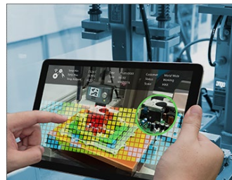
R & D Center

Nedec secures a high level of technology and future growth engines by operating a assembly line for precision motor based on the FDB(Fluid dynamic bearing) system.